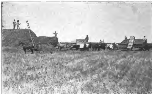
THRESHING SCENE IN WESTERN KANSAS.

ments that it can be successfully grown in Kansas. While wheat can be grown with fair success in nearly every section of the state, the great wheat belt of Kansas may be roughly described as comprising the central section of the state between 97^{\circ} and 99^{\circ} 30' , excepting Washington, Republic, Jewell and Phillips counties on the north, and Edwards, Kiowa, Comanche and Barber counties in the southwest. The wheat belt, however, is pushing from the Arkansas river towards the northwest part of the state.